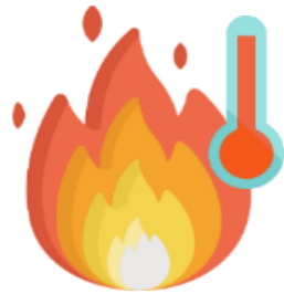
High Temperature and flame