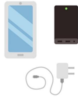
Phone & Power Bank