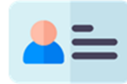
ID Card Copy